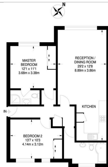
FIRST FLOOR 818 SQ FT / 76.0 SQ M