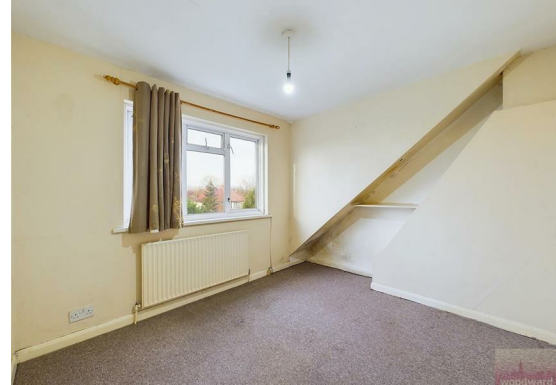
Living Room 15'10" x 12'5" (4.85 x 3.81)