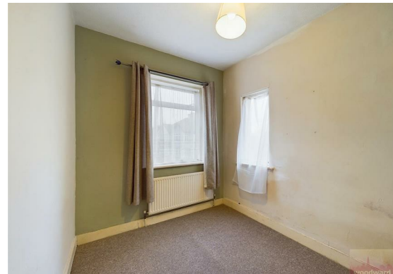
Bedroom 16'6" x 9'5" (5.04 x 2.89)