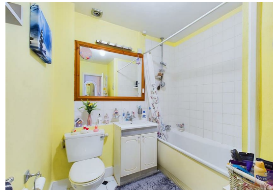
Bathroom 7'2" x 8'7" (2.20 x 2.62)