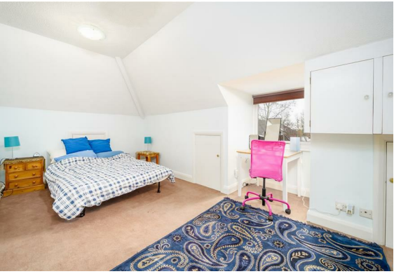
Bedroom 13'7" x 12'5" (4.16 x 3.81)