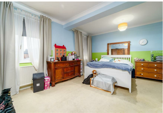
Bedroom 17'5" x 8'10" (5.33 x 2.71)