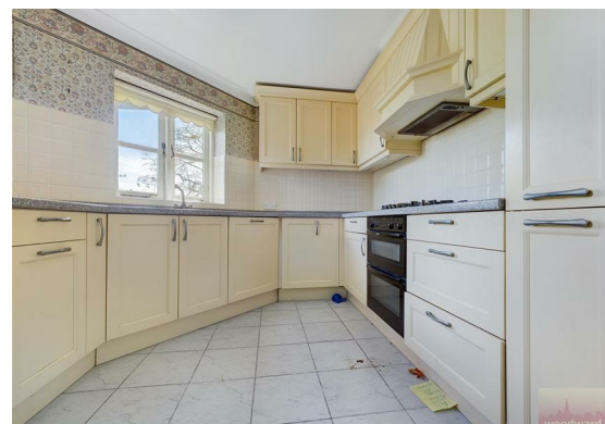
Kitchen 10'10" x 9'4" (3.32 x 2.85)